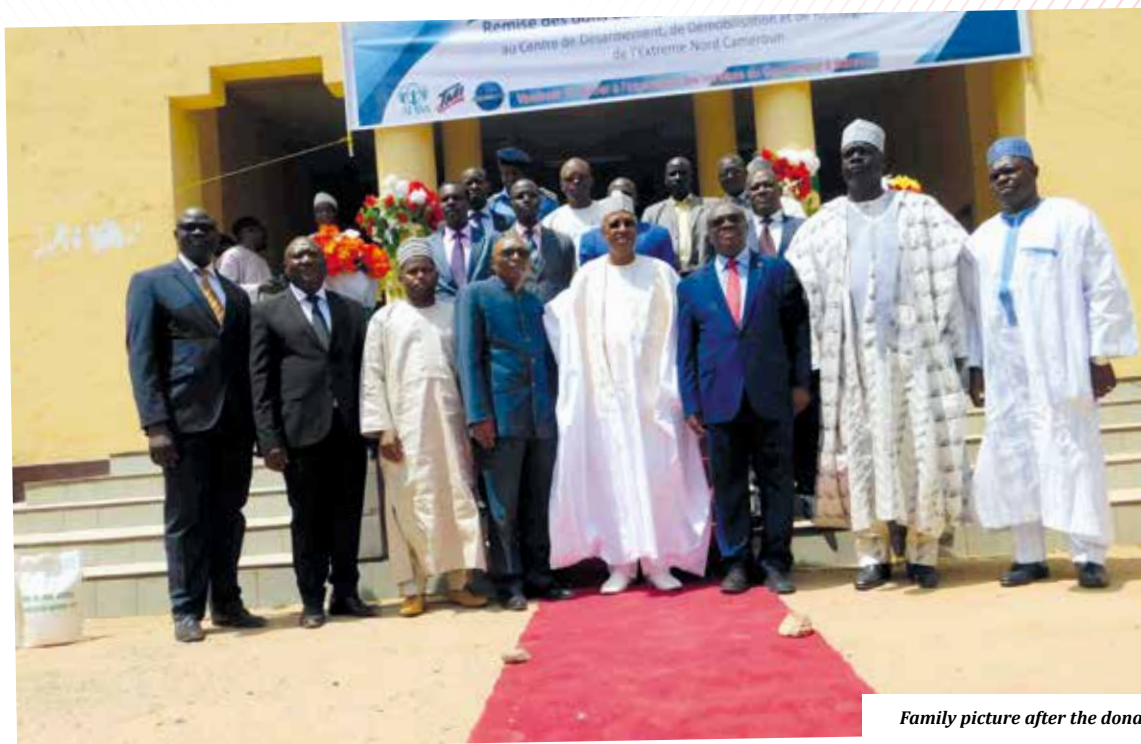
Family picture after the donation