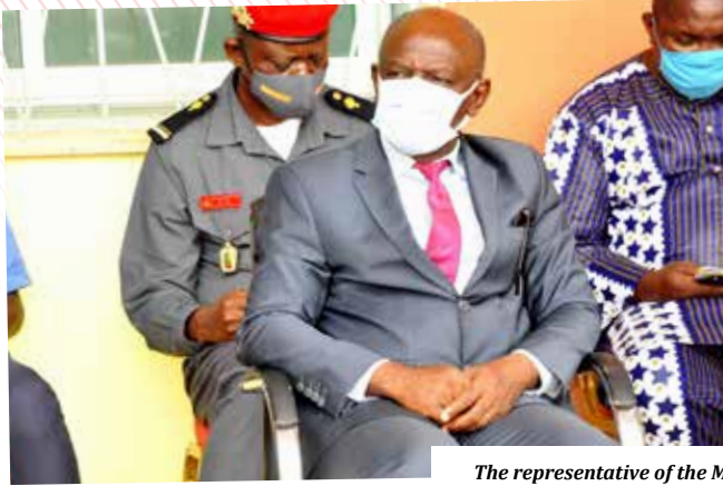
The representative of the Minister of Higher Education