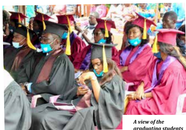
A view of the graduating students