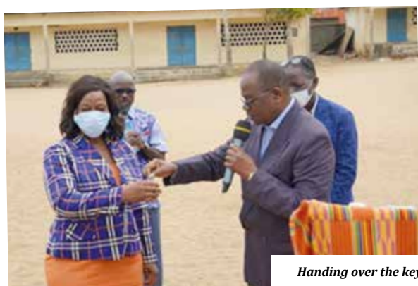
Handing over the keys