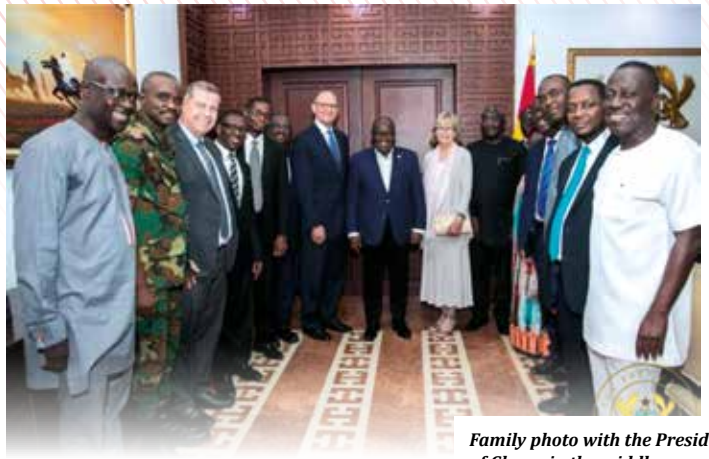
Family photo with the President of Ghana in the middle