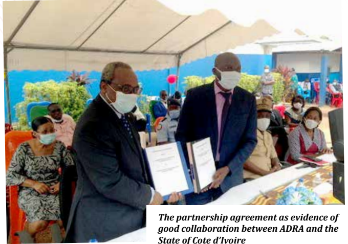
The partnership agreement as evidence of good collaboration between ADRA and the State of Cote d'Ivoire