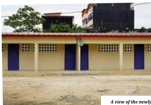
A view of the newly built toilets

drugs worth one billion two million CFA francs to the Ivorian government. Give so that you will be blessed, the more you give, the more you will be blessed” he insisted.