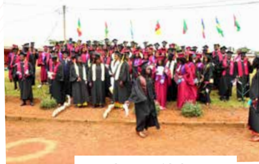
Family picture of the laureates