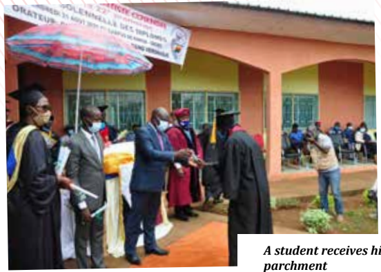
A student receives his parchment