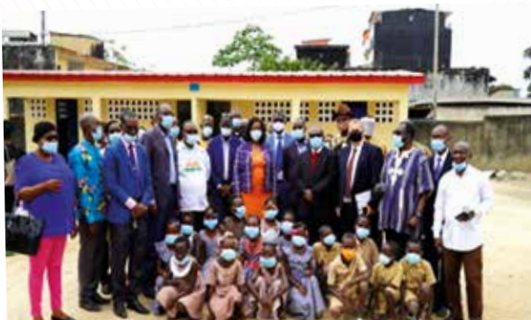
Family picture after the ceremony