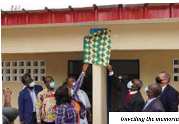
Unveiling the memorial plate