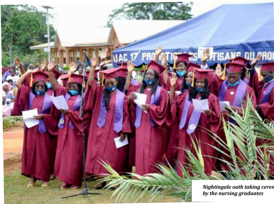
Nightingale oath taking ceremony by the nursing graduates