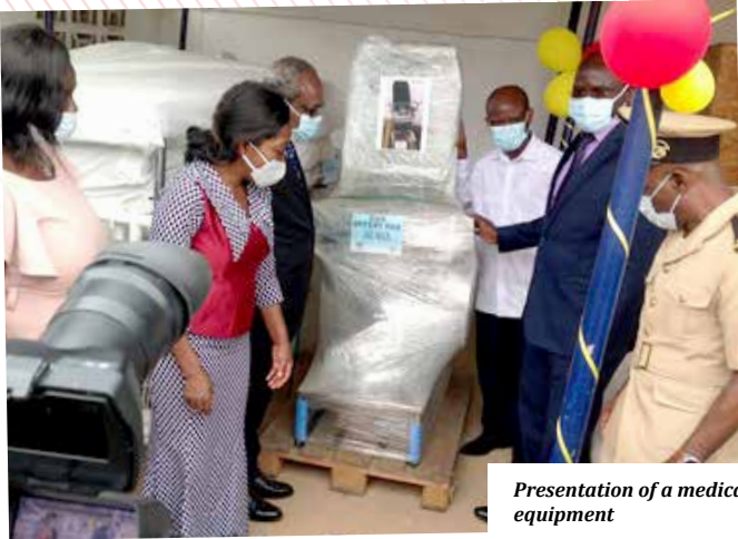
Presentation of a medical equipment